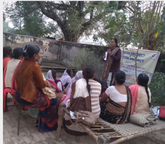
Picture : Capacitated Government frontline workers (Asha, ANM, and Anganwadi workers) on early identification and intervention for children in Varanasi and Mirzapur districts.