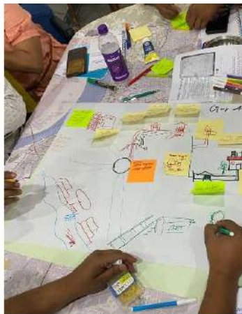
Participants sketches and post-it notes demonstrate the barriers and opportunities

in their everyday lives and to understand how we can better develop guidance to design more inclusive and accessible spaces and infrastructure for people with disabilities. With this aim in mind KIRAN Society has conducted number of interviews with various stakeholders and persons with disabilities in the city of Varanasi in the months of January- February 2021.