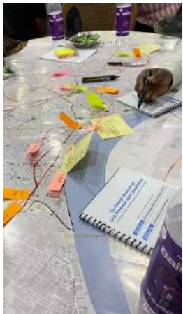
with participants' markings and highlighting areas of interest

A study led by the Global Disability Innovation Hub, University College London in partnership with the National Institute for Urban Affairs and Kiran Society